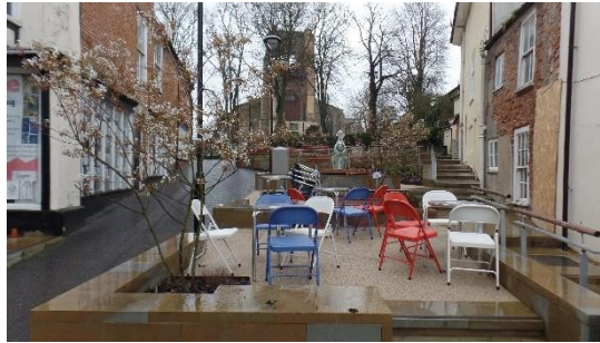
View from Market Place to St Nicholas