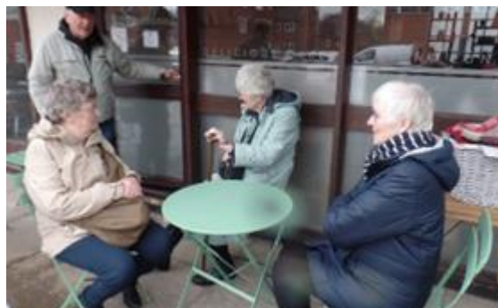
Gathering at Swallows Cafe