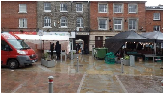
The Thursday Market packing up