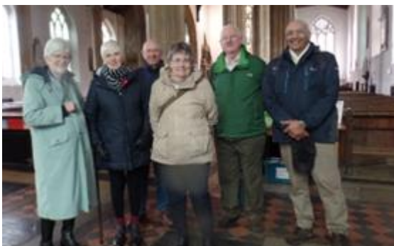
Group photo to commemorate the day

It just shows that the weather commands and you have to just go with it.